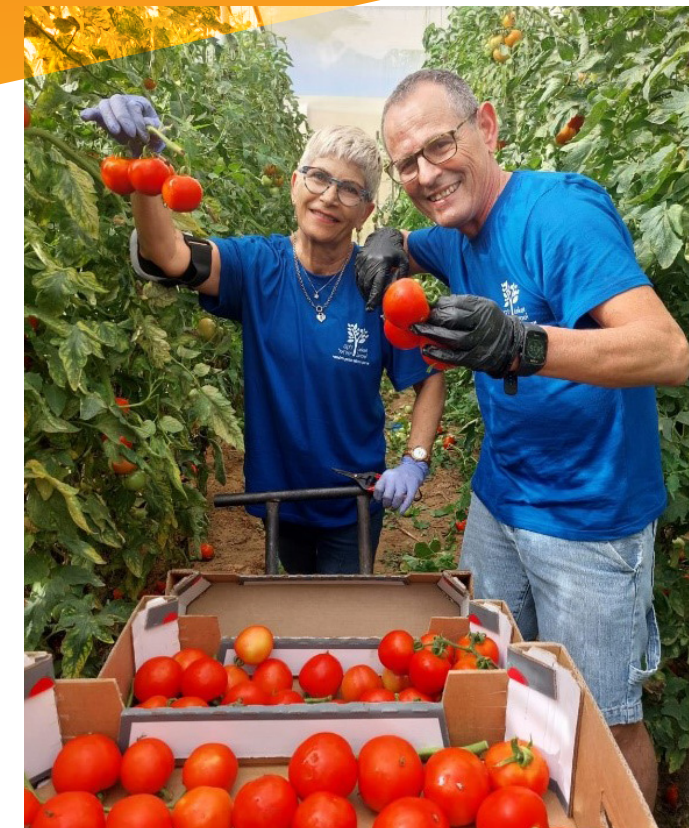
▲ JUF sent multiple solidarity and volunteer missions to Israel. Pictured here, volunteers gather produce for distribution at Leket Israel.