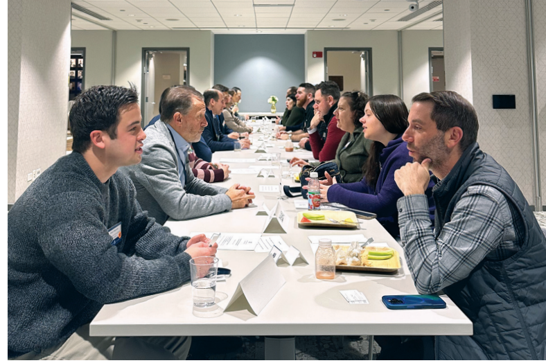
▲ A record number of young people participated in JUF programs and events in 2025, part of a surge of Jewish pride and participation. Pictured here, the JUF Professionals Network hosted professionals of all ages for its Bagels & Business speed networking event.

Heightened participation by young Jews was especially heartening. Some 14,000 Jews in their 20s and 30s engaged in programs provided by JUF and our agencies—more than ever before—along with 36,000 young families, 7,000 teens and nearly half of all Jewish college students in Illinois.