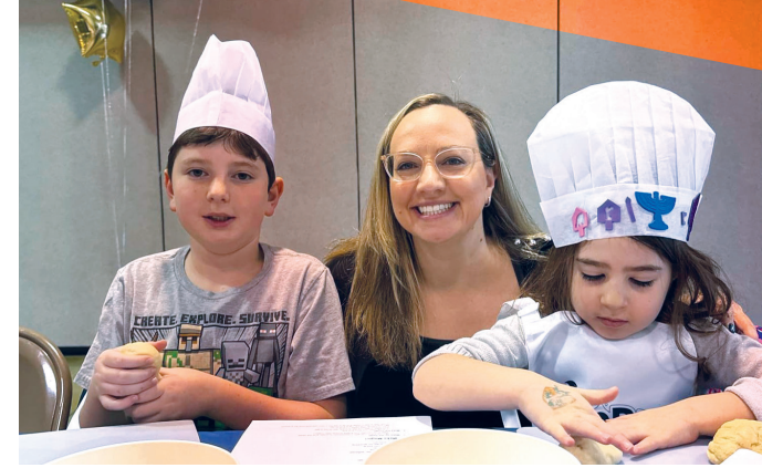
◀ Tiny chefs get in the Chanukah spirit and learn how to make sufganiyot (donuts) at an event hosted at the Lake County JCC by JUF's Russian-speaking Jewish Division.

JUF responded by launching new opportunities for people of all ages to come together, connect to community and celebrate Jewish life.