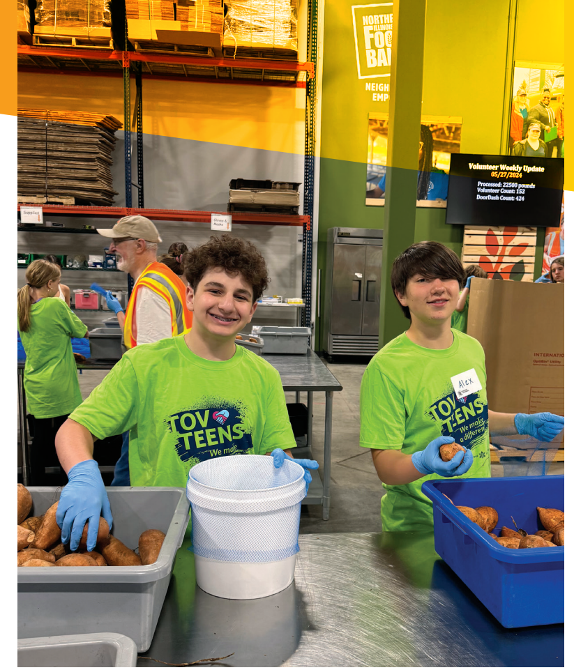
▲ Nearly 12,000 people of all ages engaged in volunteerism through JUF's TOV Volunteer Network, delivering groceries and serving meals to those in need, visiting homebound seniors and cleaning up neglected neighborhoods.

This year, a record level of financial aid was given to local Holocaust survivors, largely for home care, part of the specialized assistance provided to help them continue to live with independence and dignity.