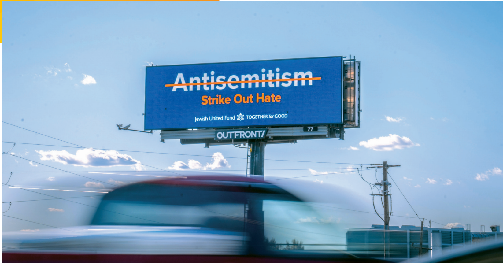
▲ In October, an offensive and hateful billboard appeared on the Edens spur in Northbrook. JUF intervened to get it taken down and replaced with this powerful message.