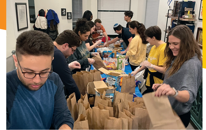
▲ With four local neighborhood locations, Silverstein Base Chicago has become a cornerstone of JUF's young adult programming, engaging thousands of Jews in their 20s and 30s in Jewish life, learning and community. Pictured here, volunteers with Base Logan Square and Repair the World Chicago pack meals for the Night Ministry.

As a result, in 2025 the number of people participating in JUF programs and events doubled. Young adults especially showed up—for each other and for their community—in record numbers.