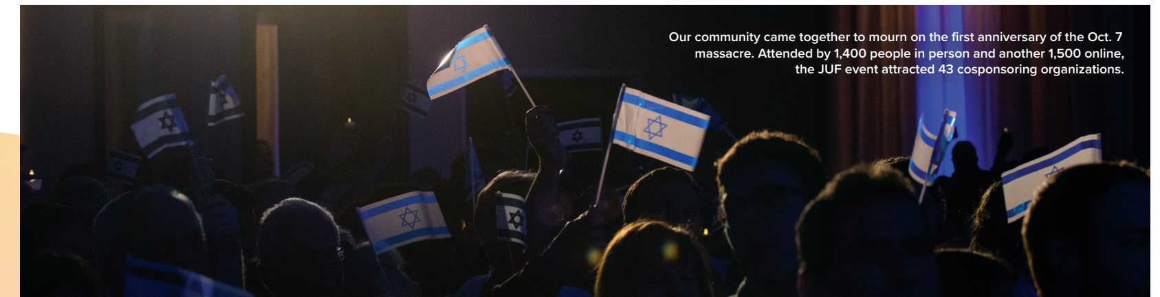
Our community came together to mourn on the first anniversary of the Oct. 7 massacre. Attended by 1,400 people in person and another 1,500 online, the JUF event attracted 43 cosponsoring organizations.