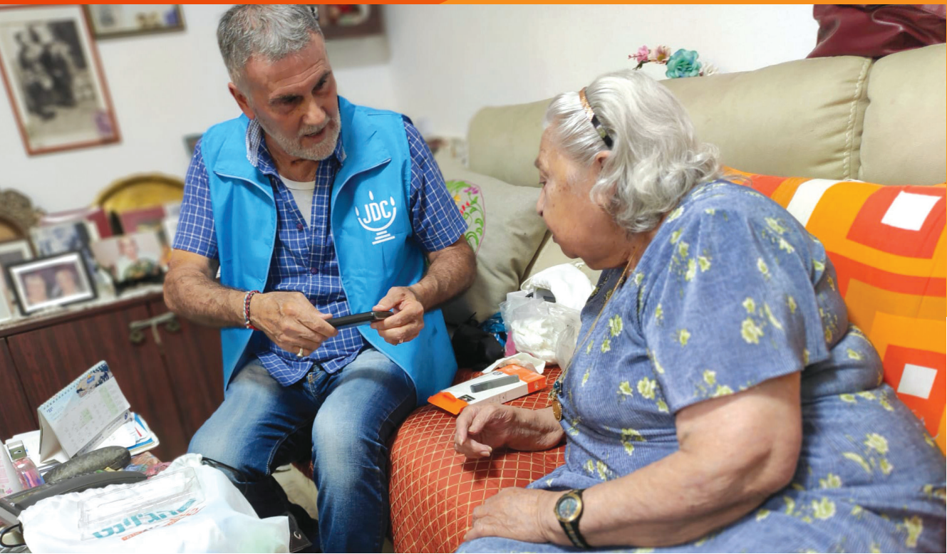
▲ An elderly Israeli woman receives an emergency kit and preparedness training from a JDC worker. JDC is a JUF partner that has provided intensive services to vulnerable people since Oct. 7.