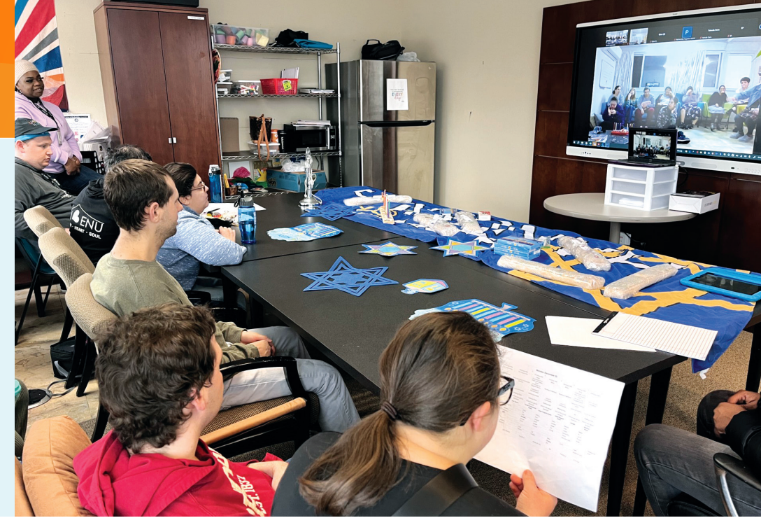
◀ In 2025, a new initiative engaged young adults with disabilities from JUF-supported programs in both Chicago and in Israel, enabling them to celebrate Jewish holidays together virtually. Pictured here, members of Keshet's GADOL program in Chicago and the SHEKEL program in Israel gather via Zoom to celebrate Chanukah.

Below are the strategic grant focus areas and list of FY25 grantees: