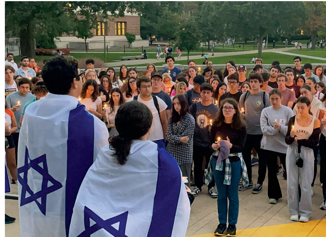
▼ Throughout the year, JUF worked to ensure a safe and welcoming environment for Jewish students on Illinois college campuses. Pictured here, UIUC students gather for a pro-Israel vigil.

But fighting the cancer of antisemitism starts with prevention and early detection.