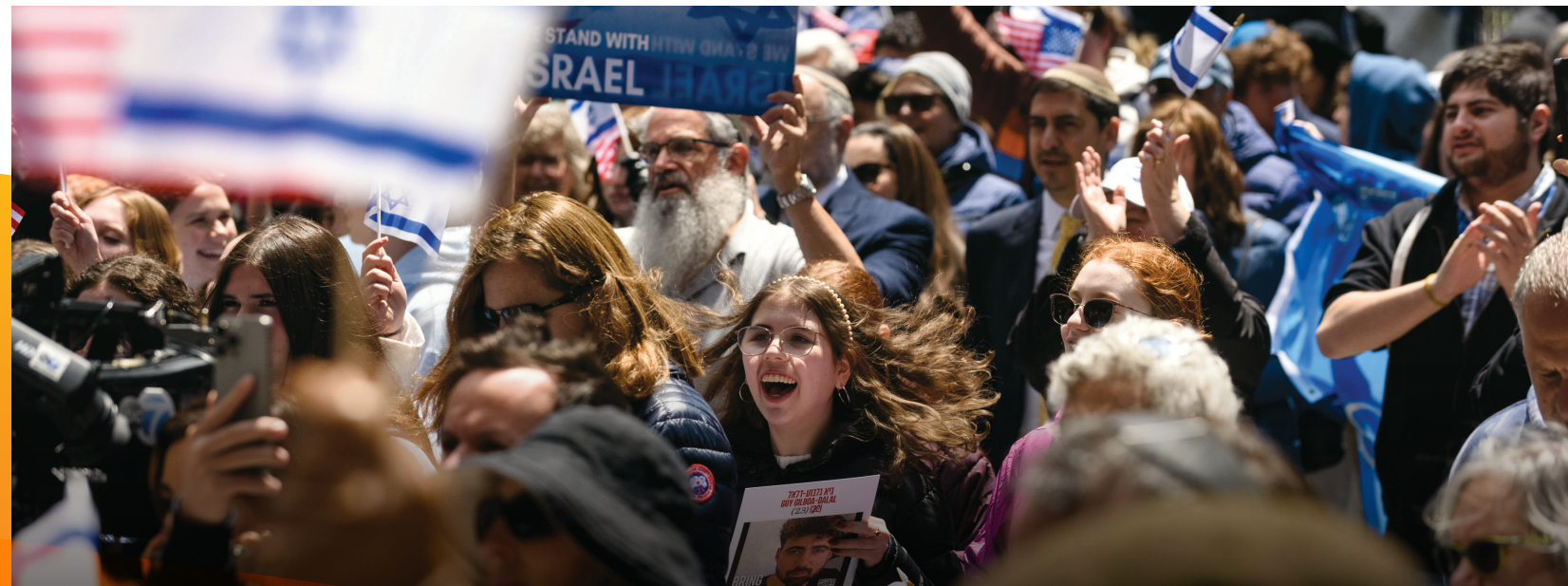
In May, JUF hosted a Yom HaAtzmaut celebration in Daley Plaza. The event, held in the heart of Chicago's Loop, honored Israel's 77 years of independence and the resilience of the Israeli people, while spotlighting the plight of the hostages still held by Hamas.