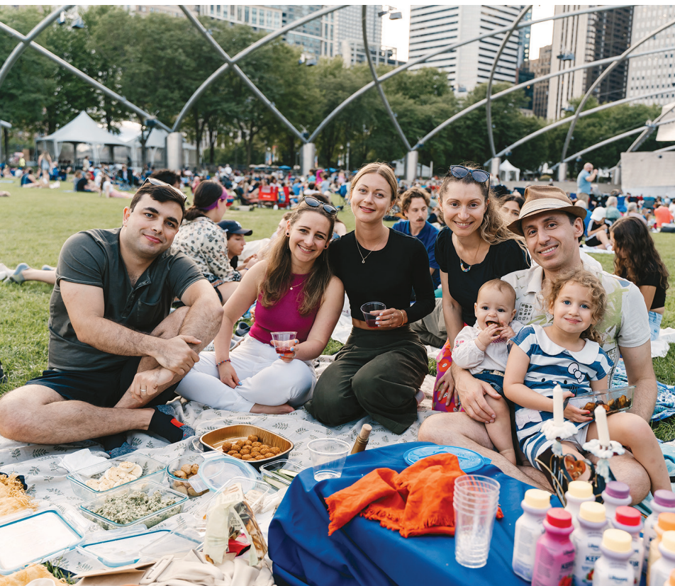
▲ JUF's Russian-speaking Jewish Division hosted a Shabbat celebration in Millennium Park, one of countless examples of opportunities for young families to come together.

In 2025, twice as many people came to JUF programs and events as the year before.